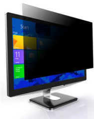
TARGUS 24" 4VU PRIVACY SCREEN

All-in-One. Its small base frees valuable workspace.