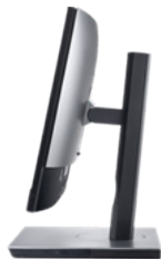
OPTIPLEX 7470 ALL-IN-ONE DVD+/-RW IN HEIGHT ADJUSTABLE STAND

Raise, tilt, pivot or swivel your All-In-One with a stand that delivers personalized comfort and viewing angles.