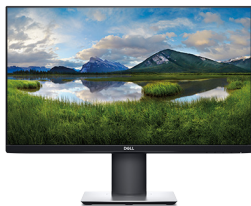
DELL 24 MONITOR - P2419H

Boost This 23.8" FHD screen with 3-sided ultrathin bezels is designed for seamless multi-display productivity with your 24"