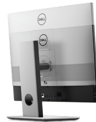
OPTIPLEX 7470 ALL-IN-ONE HEIGHT ADJUSTABLE STAND

Tilt your display forward, backward, or recline to a 60 degree angle. This stand makes touchscreen interaction comfortable.