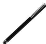
TARGUS STYLUS FOR CAPACITIVE TOUCH DEVICES

Compact design and chiclet keys, this essential desktop solution offers the convenience of wireless and clutter-free performance.