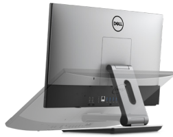
OPTIPLEX 7470 ALL-IN-ONE ARTICULATING STAND

Tilt your display forward, backward, or recline to a 60 degree angle. This stand makes touchscreen interaction comfortable.