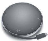
DELL MOBILE SPEAKERPHONE | MH3021P

Designed to work seamlessly across 3 devices, this compact keyboard mouse combo keeps your desk clutter-free and lets you stay productive with up to 36 months 26 of battery life.