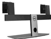
DELL DUAL MONITOR STAND | MDS19

Multipoint with integrated speakerphone offers an all-in-one connectivity and conferencing solution.