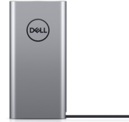
DELL NOTEBOOK POWER BANK PLUS - USB C, 65 WH | PW7018LC

Compact and portable 7-in-1 USB-C mobile adapter provides superb video, data connectivity and up to 90W power pass-through to your PC.