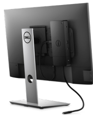
DELL DOCKING STATION MOUNTING KIT | MK15

Work at full speed with Dell's powerful Thunderbolt Dock. Charge your system faster, support up to two 4K displays and connect to your peripherals via a single cable.