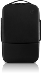
DELL PRO HYBRID BRIEFCASE BACKPACK 15 | PO1520HB

Protect your laptop from impact with this earth friendly backpack that is lined with EVA foam cushioning. Easily convert from backpack to briefcase mode and travel with ease.