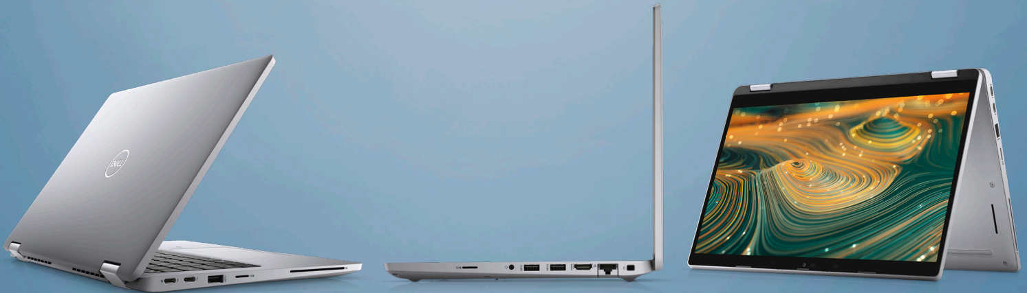
5320 is configurable as a laptop or 2-in-1