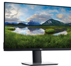
DELL 27 USB-C MONITOR | P2720DC

Easily attach your Dell Dock to the Dell Dock Mounting Kit and mount it behind a monitor, to a wall or under the desk for a clutter-free workspace.